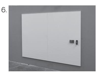
Repeat steps 4 & 5 until all panels are in place

Hang next panel in the sequence and carefully push the two panels together by lifting slightly on the sliding panel and pushing towards the stationary one. Be sure to align steel spline with slot in adjacent panel. DO NOT "force" the panels together. If the spline is properly aligned with the slot they should easily slip together until the gap is closed. If the gap will not close so the two edges are touching, check to make sure that the slot/spline is clear and free of debris and engaging properly. Use caution when sliding the panels together, excess rubbing and bumping of the edges together will damage the porcelain.