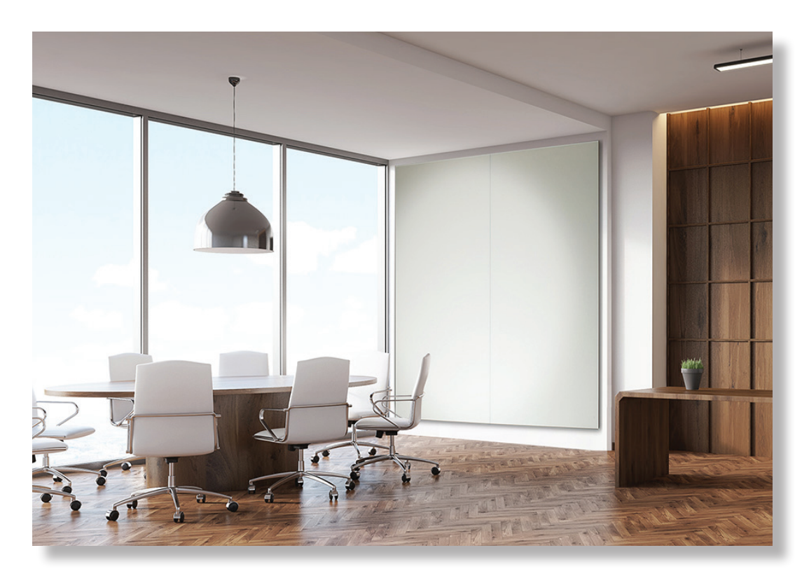
Vertical Markerboard Mounting Instructions